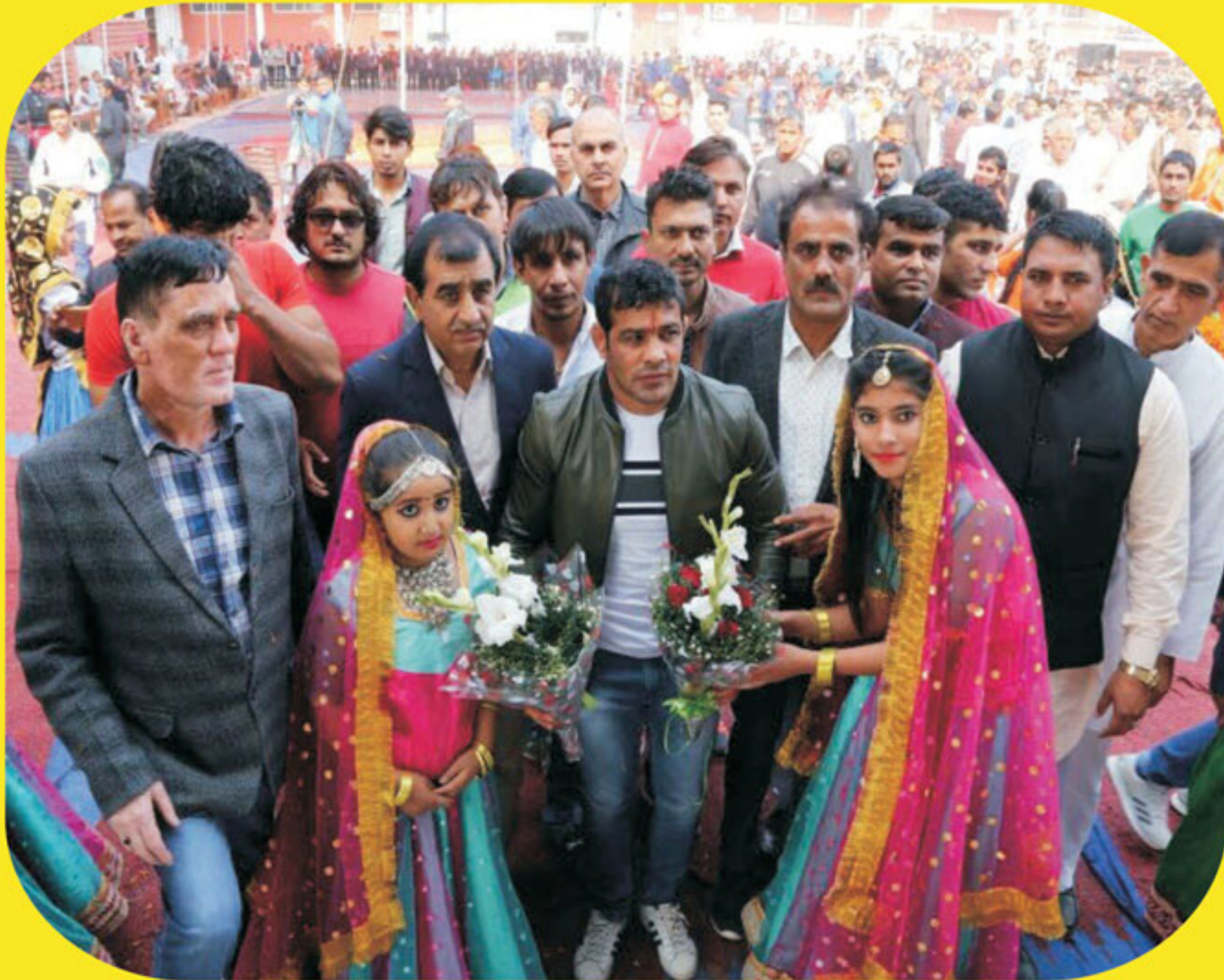
School welcomes Olympian Sushil Kumar as Chief Guest at 64 th National Girls Wrestling Championship