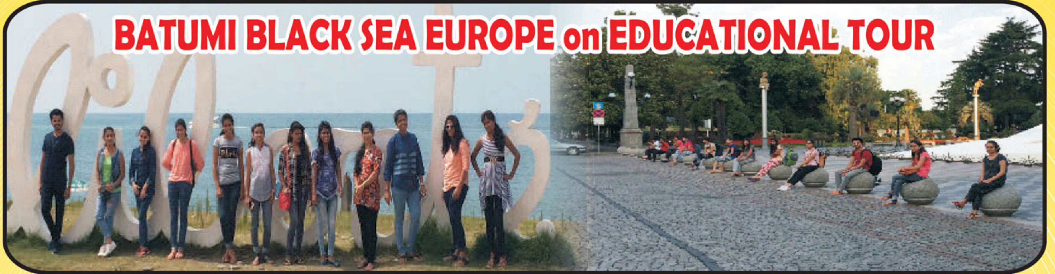
BATUMI BLACK SEA EUROPE on EDUCATIONAL TOUR