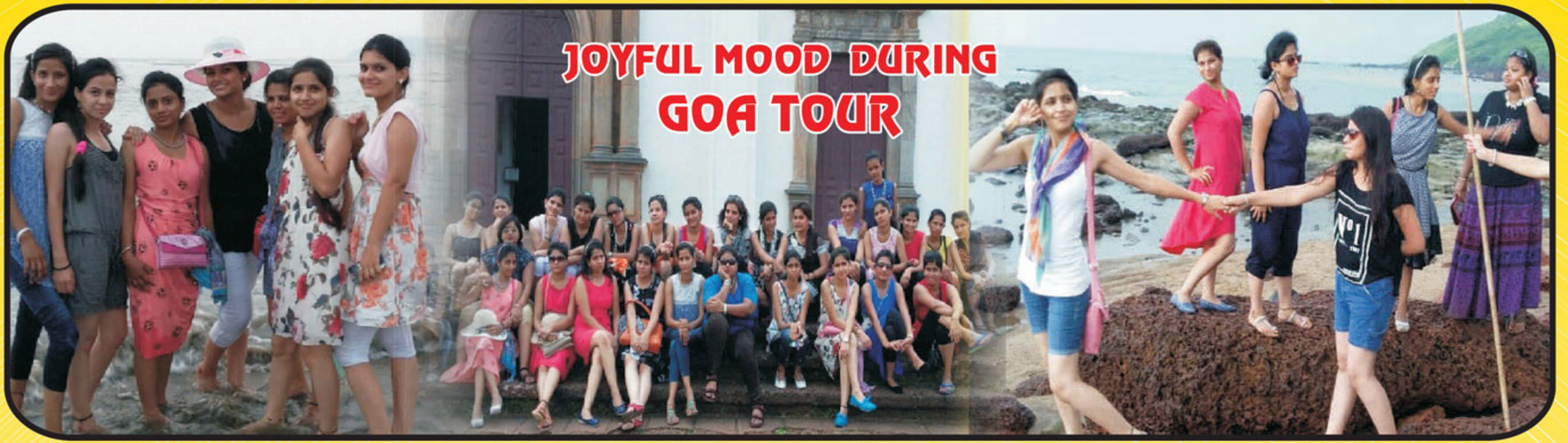
JOYFUL MOOD DURING GOA TOUR