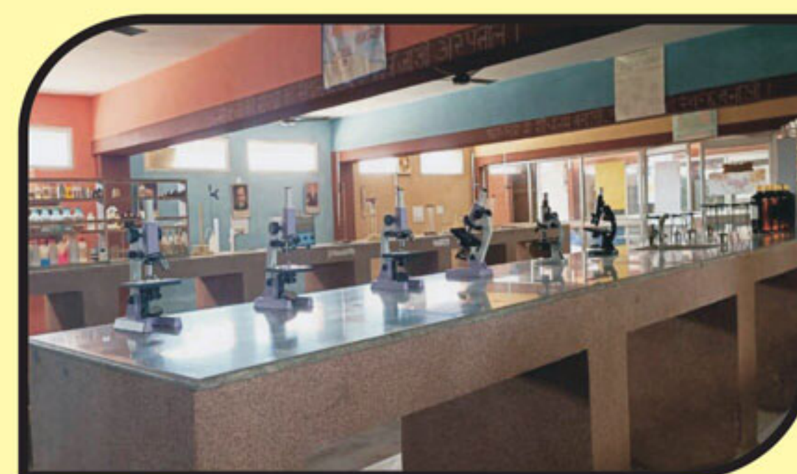
MICRO - BIO LAB