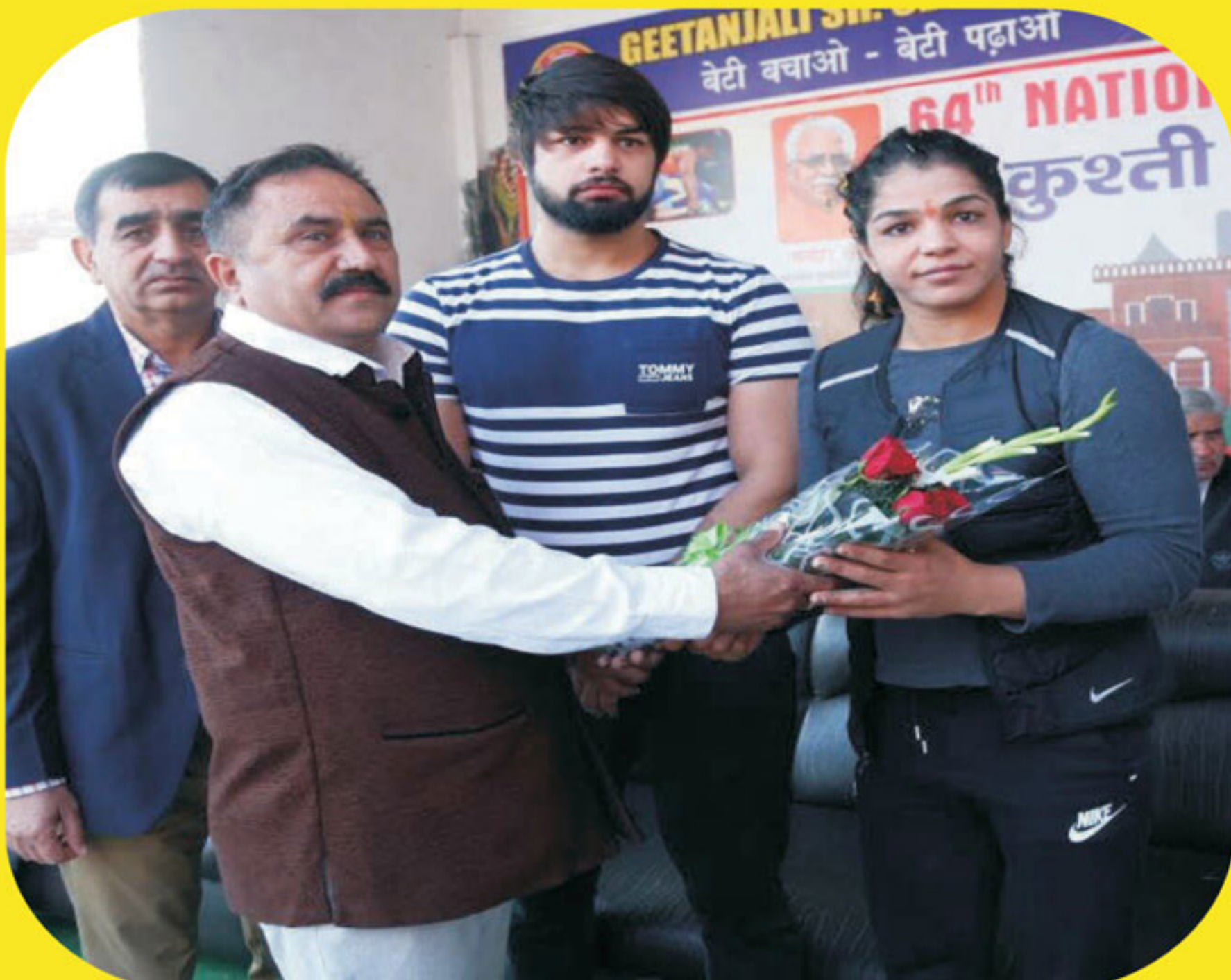
Olympian SAKSHI MALIK being Welcomed by Hon'ble Chairman