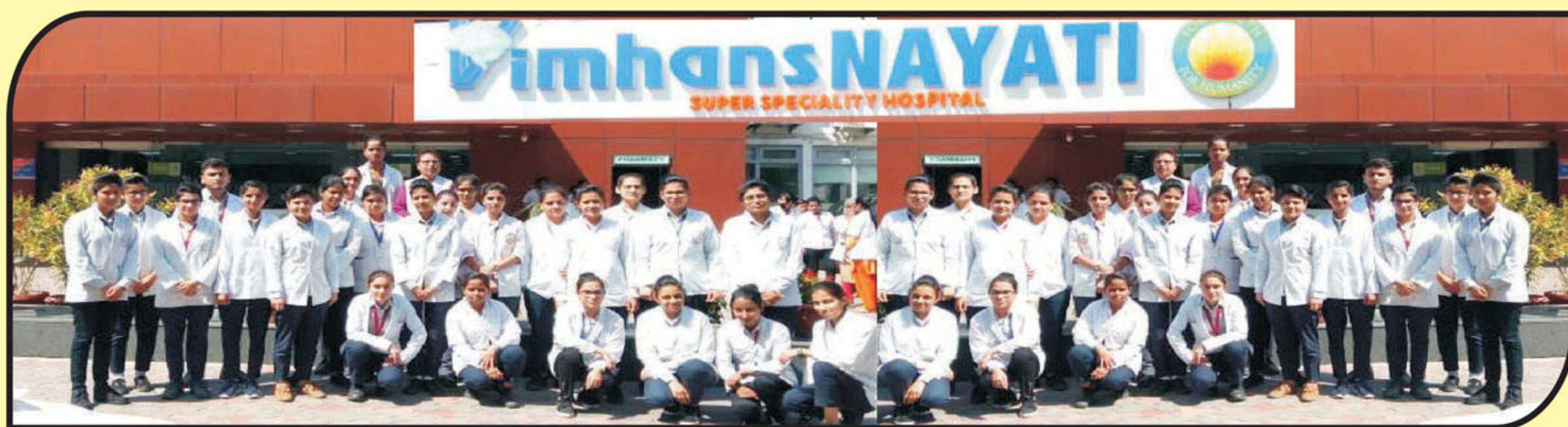
DURING THE PSYCHIATRIC TRAINING VIMHANS NAYATI DELHI