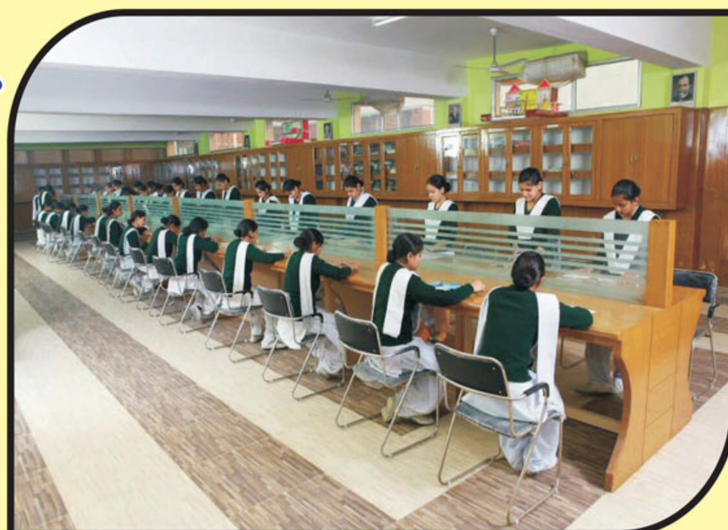
LIBRARY THE HEART OF LITERACY

देश विदेश में Hospital ट्रेनिंग देने वाला संस्थान