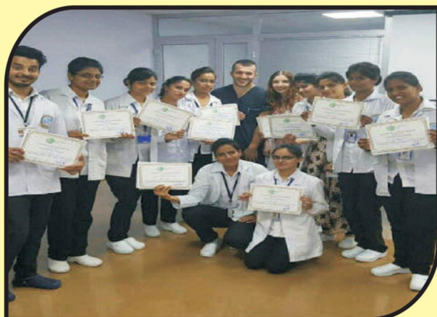
TRAINING AT TBILISI CENTRAL HOSPITAL, GEORGIA EUROPE

देश विदेश में Hospital ट्रेनिंग देने वाला संस्थान